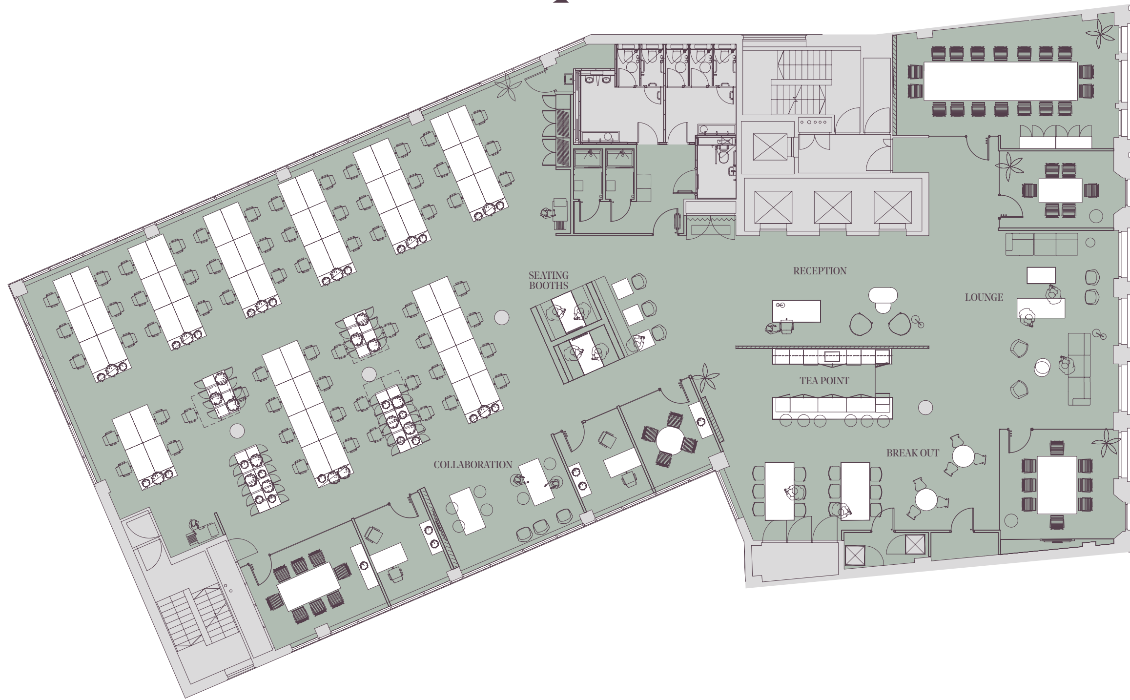
Second Floor – 7,959 sq. ft